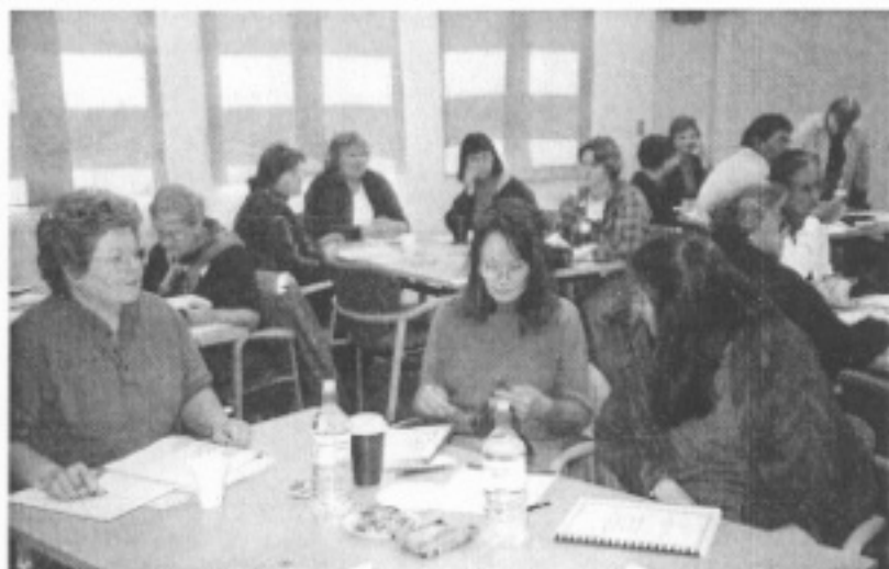
Training volunteers in the newest protocols used at the New Mexico State Records and Archives Center in Santa Fe.